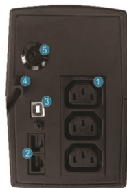
500VA - 800VA