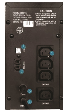
1500VA - 2000VA