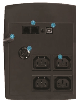
1200VA - 1500VA