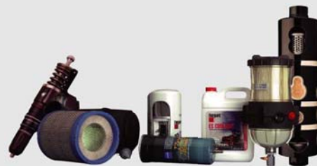
500 hours genset spare parts