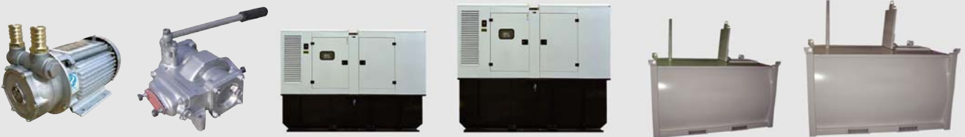
Auto filling fuel pump