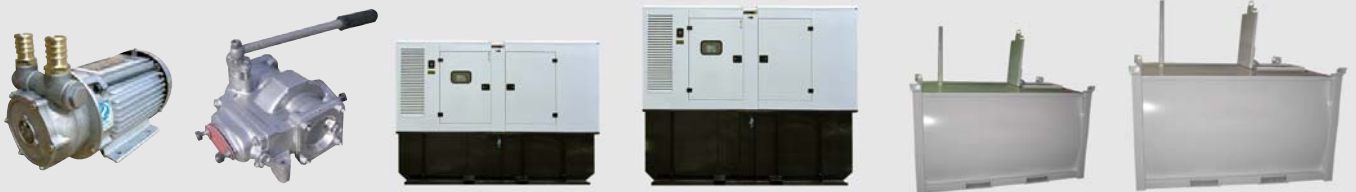
Auto filling fuel pump