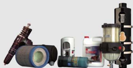
500 hours genset spare parts