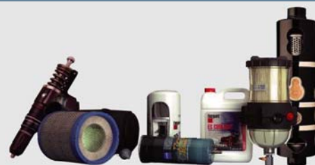
500 hours genset spare parts